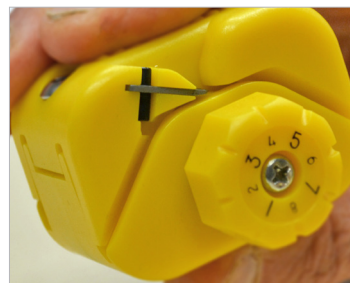
Spring-loaded design eliminates need to lock or clamp tool while in use.