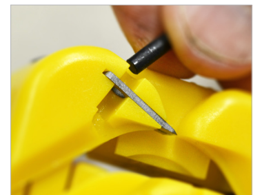
Fixed stainless steel blades require no adjustments and replace easily.

For more information or to locate the nearest authorized Ripley® distributor, please visit www.ripley-tools.com or call 1 (800) 528-8665 to speak to a customer service representative.