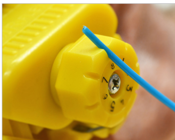
Built-in sizing channels determine proper setting for loose tube cables.