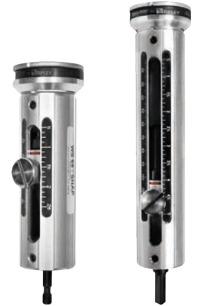
WS 68 SNAP WS 68 SNAP XL