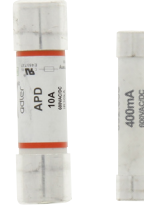
F-337P 10A (600V) & 400mA (600V) Fuses for 61-337