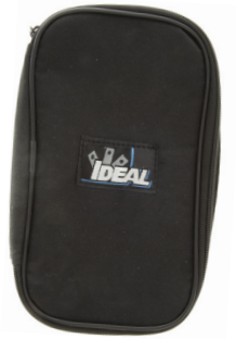
C-357 Nylon Carrying Case