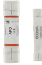
F-347-357P 11A (1000V) & 600mA (1000V) Fuses for 61-347 & 61-357