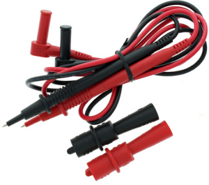
TL-757 Test Leads