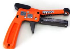
Upper-jaw is open

The FST-12 is a tool to split a 12-fiber ribbon into individual fibers with separation ratio from 1:11 to 6:6. This handy tool is designed for operation in limited space in splice closure. Sub-groups of fibers can be extracted by performing two overlapping separation of the ribbon.