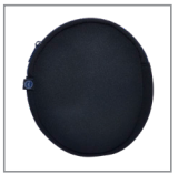
SOFT SHELL CARRY CASE