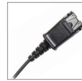
JPL/PLX COMPATIBLE QD