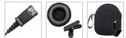
PLX OR GN COMPATIBLE QD