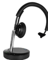
VT W320 Mono