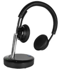
VT W320 Duo