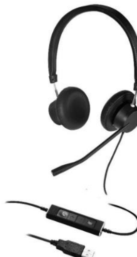
VT X140 USB Duo