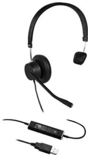
VT X140 USB Mono